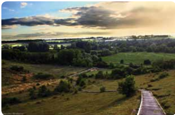
View from St. Catherine's Hill

St. Catherine's Hill is a wildlife-rich chalk grassland nature reserve with an abundance of wildflowers and butterflies. The Hill is also an Iron Age hill fort and boasts spectacular views over Winchester and the Itchen Valley. The reserve is owned by Winchester College and managed by the Wildlife Trust. In the summer, look out for musk orchids and frog orchids on the south facing slope.