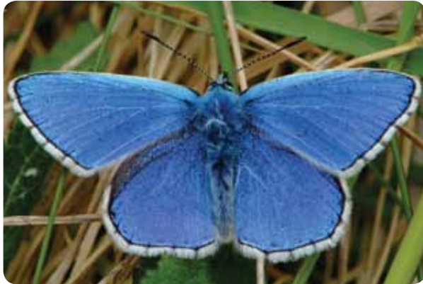
Adonis blue butterfly

Chalk grassland is home to a wide variety of plants and animals. Grazing animals help to maintain the balance of different plants found here, which provide valuable food for rare butterflies including the Adonis blue, silver-spotted skipper and Duke of Burgundy. It is also a home for many threatened birds, including skylarks.