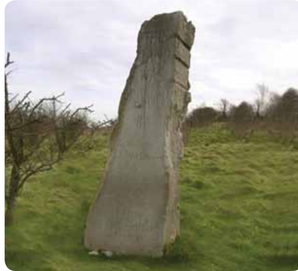
Twyford Down monument

In December 1991, Twyford Down became the site of the UK's first road protest camp when environmentalists gathered to try and hinder work on the construction of the final link in the M3. Despite years of protests, the highly controversial road building project was completed in 1994.